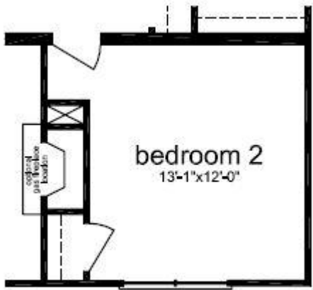
optional fireplace layout