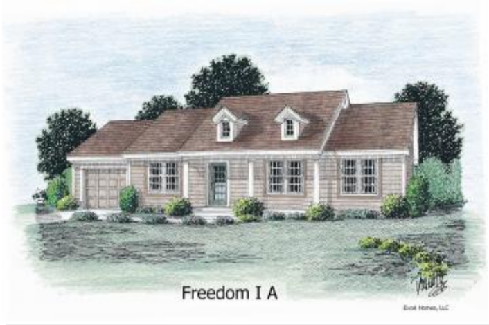
Freedom I A