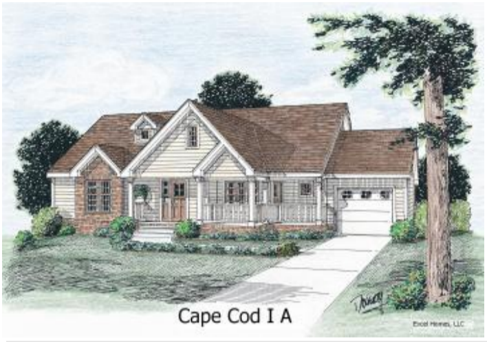
Cape Cod 1 A